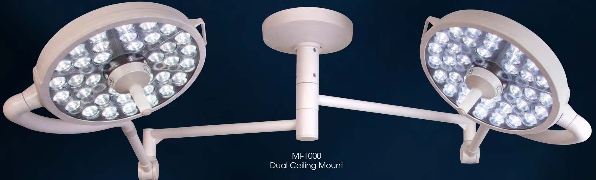
MI-1000 Dual Ceiling Mount