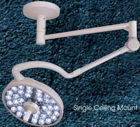
Single Ceiling Mount